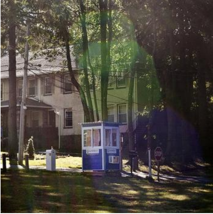
Troubled Girls Were Sent to This Town to Heal. Many Were Lured Into the Sex Trade Instead.