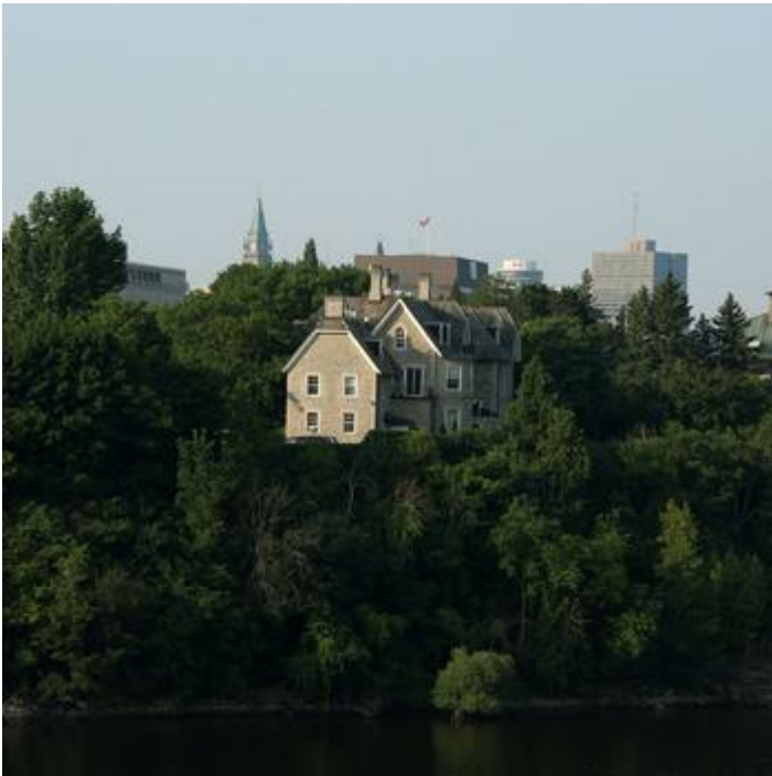
Justin Trudeau's Official Home: Unfit for a Leader or Anyone Else